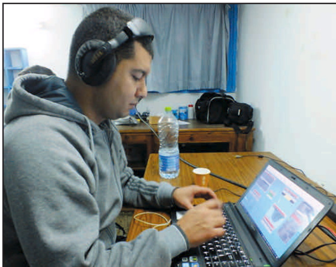
Ash, 3V8SS, operating 3V8CB on CW. Where is all the equipment?