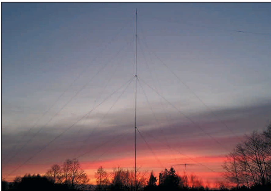
Sunset on the vertical at SN2M.