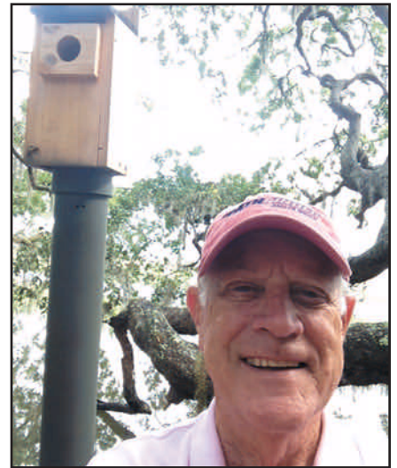
Val, N4RJ, made some QSOs at night, while looking for birds in the day.